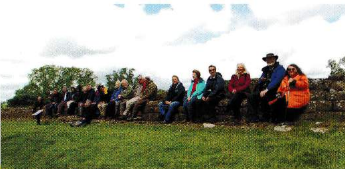
Taking rest on Hadrian's Wall - the 2017 field trip

Practical archaeology remains at the centre of our activities, offering opportunities for field experience and the acquisition of skills for all ages. The 2018 season will again be at the regionally significant Druce Farm Roman villa near Dorchester.